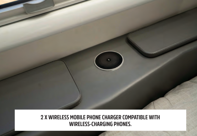
2 X WIRELESS MOBILE PHONE CHARGER COMPATIBLE WITH WIRELESS-CHARGING PHONES.