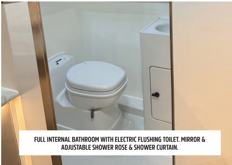
FULL INTERNAL BATHROOM WITH ELECTRIC FLUSHING TOILET. MIRROR & ADJUSTABLE SHOWER ROSE & SHOWER CURTAIN.