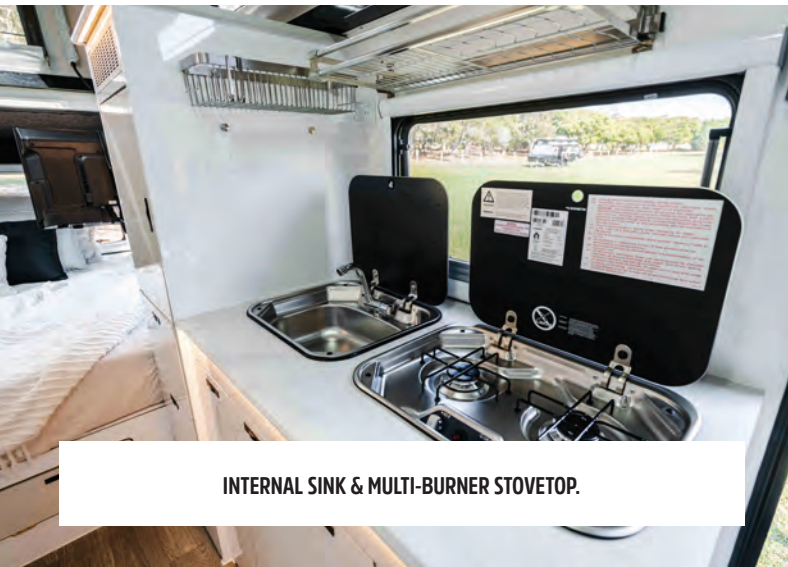
INTERNAL SINK & MULTI-BURNER STOVETOP.