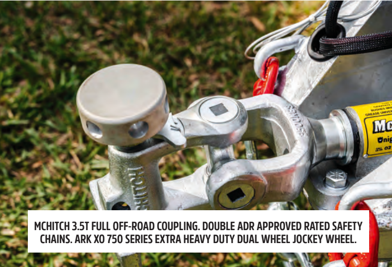
MCHITCH 3.5T FULL OFF-ROAD COUPLING. DOUBLE ADR APPROVED RATED SAFETY CHAINS. ARK XO 750 SERIES EXTRA HEAVY DUTY DUAL WHEEL JOCKEY WHEEL.