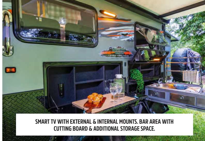
SMART TV WITH EXTERNAL & INTERNAL MOUNTS. BAR AREA WITH CUTTING BOARD & ADDITIONAL STORAGE SPACE.