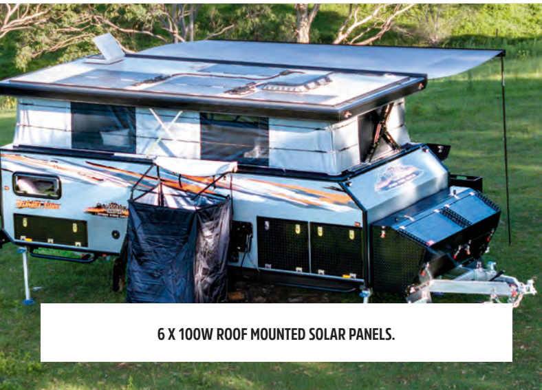
6 X 100W ROOF MOUNTED SOLAR PANELS.