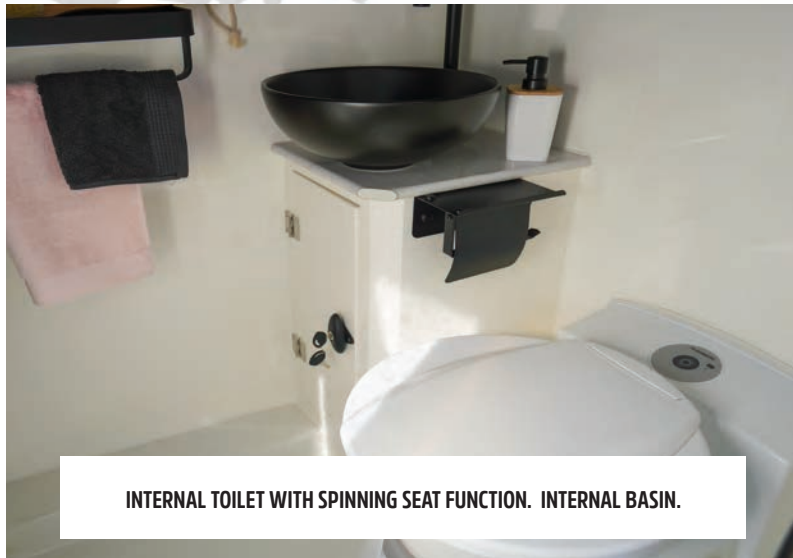
INTERNAL TOILET WITH SPINNING SEAT FUNCTION. INTERNAL BASIN.