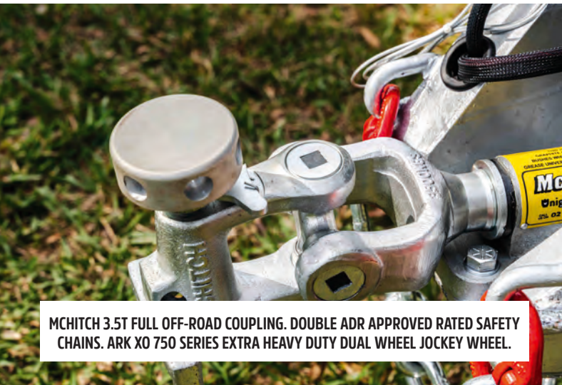
McHITCH 3.5T FULL OFF-ROAD COUPLING. DOUBLE ADR APPROVED RATED SAFETY CHAINS. ARK XO 750 SERIES EXTRA HEAVY DUTY DUAL WHEEL JOCKEY WHEEL.