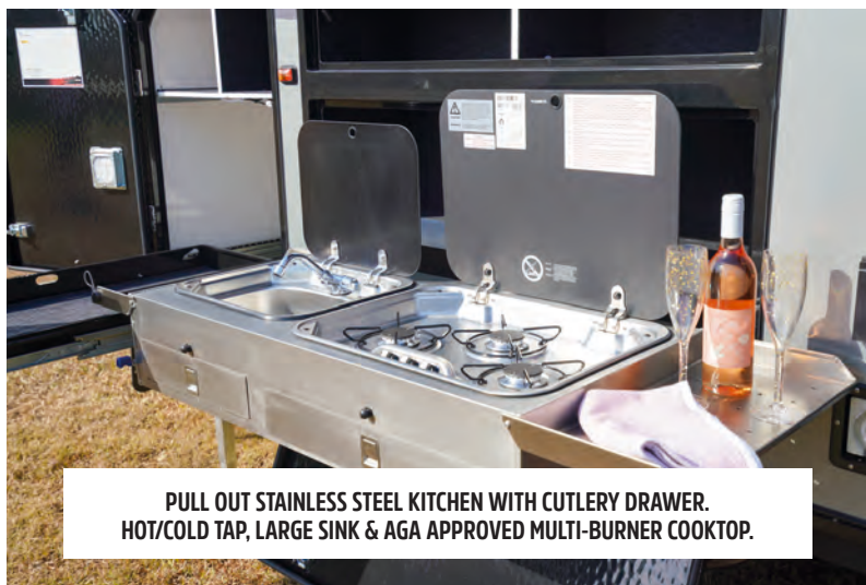
PULL OUT STAINLESS STEEL KITCHEN WITH CUTLERY DRAWER. HOT/COLD TAP, LARGE SINK & AGA APPROVED MULTI-BURNER COOKTOP.