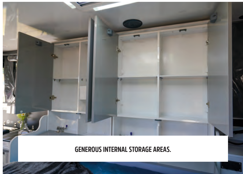
GENEROUS INTERNAL STORAGE AREAS.