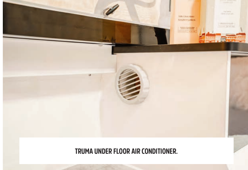
TRUMA UNDER FLOOR AIR CONDITIONER.