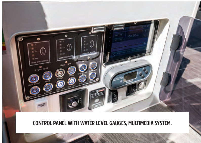
CONTROL PANEL WITH WATER LEVEL GAUGES, MULTIMEDIA SYSTEM.