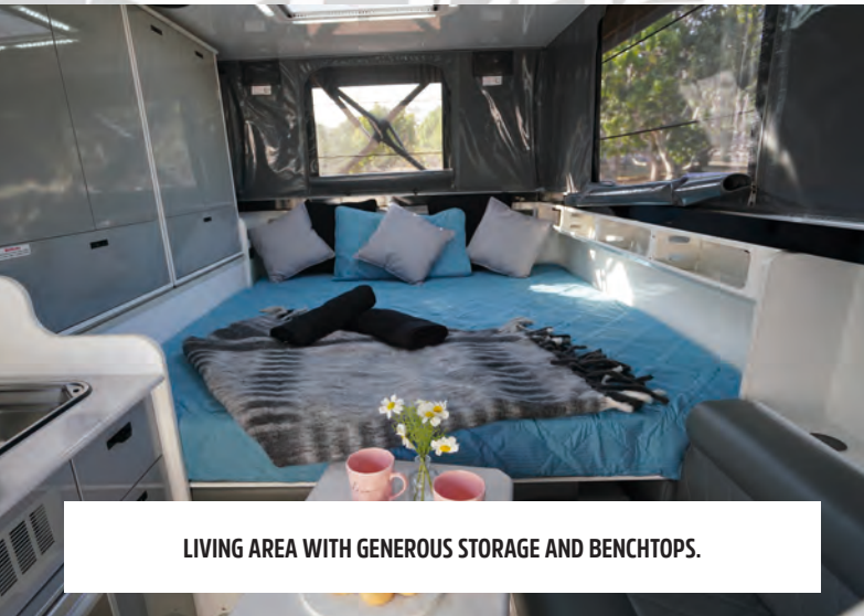
LIVING AREA WITH GENEROUS STORAGE AND BENCHTOPS.