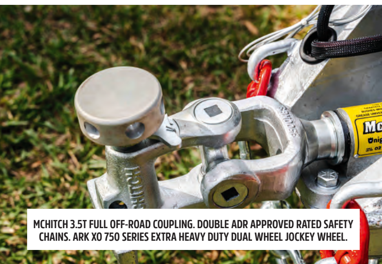
MCHITCH 3.5T FULL OFF-ROAD COUPLING. DOUBLE ADR APPROVED RATED SAFETY CHAINS. ARK XO 750 SERIES EXTRA HEAVY DUTY DUAL WHEEL JOCKEY WHEEL.