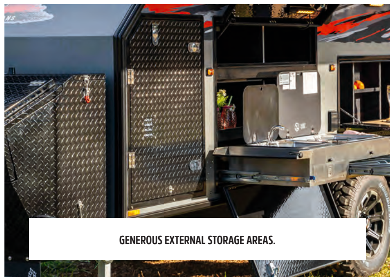
GENEROUS EXTERNAL STORAGE AREAS.