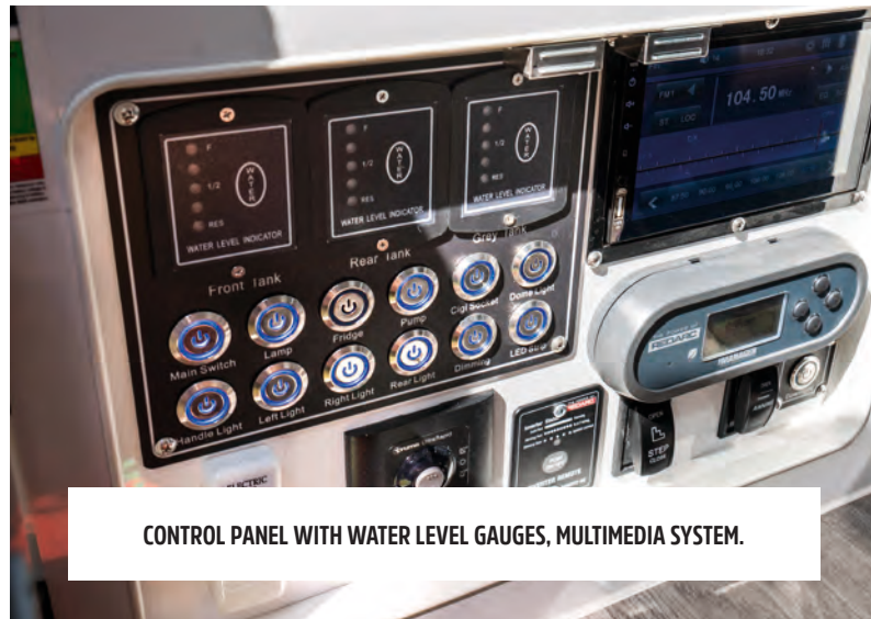
CONTROL PANEL WITH WATER LEVEL GAUGES, MULTIMEDIA SYSTEM.