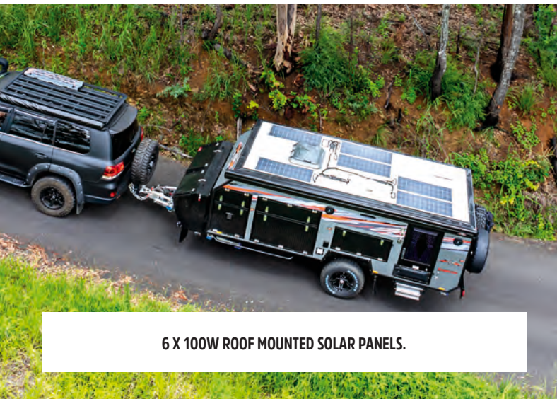
6 X 100W ROOF MOUNTED SOLAR PANELS.