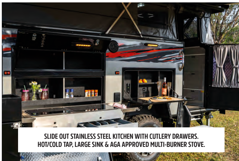
SLIDE OUT STAINLESS STEEL KITCHEN WITH CUTLERY DRAWERS. HOT/COLD TAP, LARGE SINK & AGA APPROVED MULTI-BURNER STOVE.