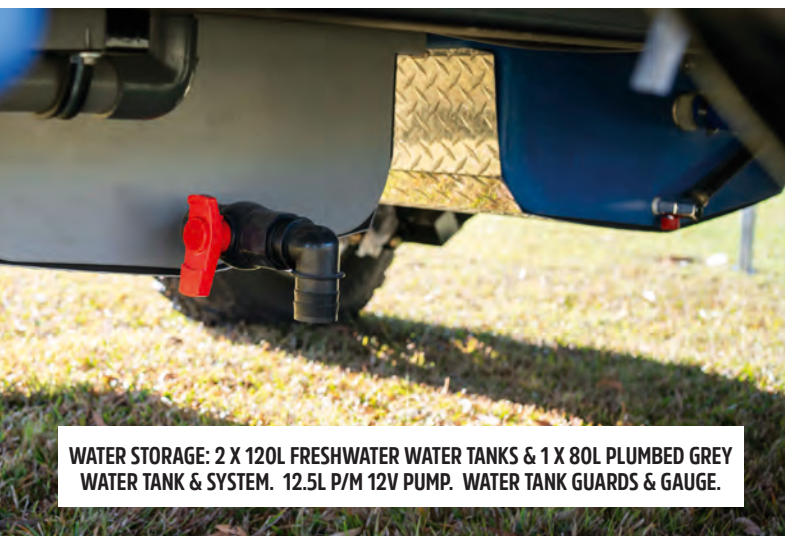
WATER STORAGE: 2 X 120L FRESHWATER WATER TANKS & 1 X 80L PLUMBED GREY WATER TANK & SYSTEM. 12.5L P/M 12V PUMP. WATER TANK GUARDS & GAUGE.