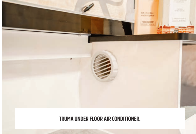
TRUMA UNDER FLOOR AIR CONDITIONER.