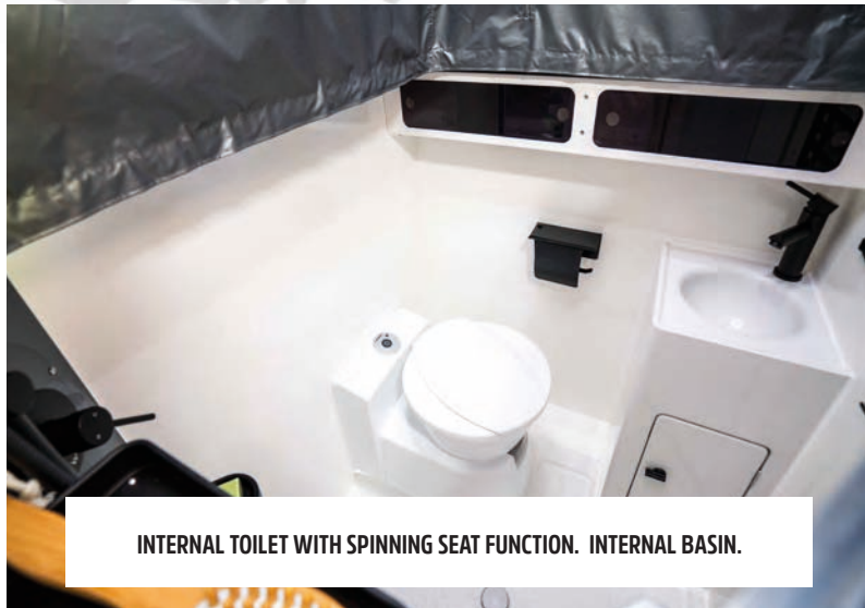
INTERNAL TOILET WITH SPINNING SEAT FUNCTION. INTERNAL BASIN.