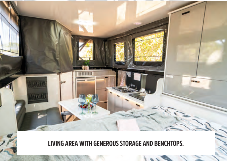
LIVING AREA WITH GENEROUS STORAGE AND BENCHTOPS.