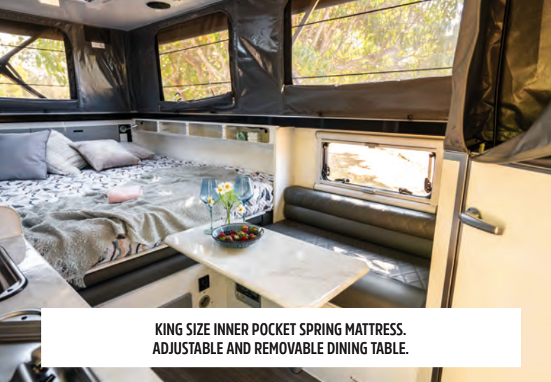
KING SIZE INNER POCKET SPRING MATTRESS. ADJUSTABLE AND REMOVABLE DINING TABLE.