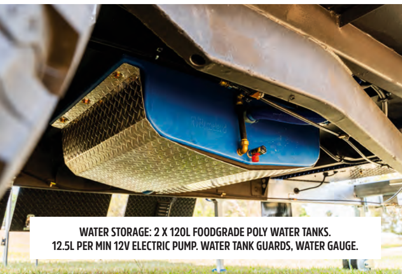
WATER STORAGE: 2 X 120L FOODGRADE POLY WATER TANKS. 12.5L PER MIN 12V ELECTRIC PUMP. WATER TANK GUARDS, WATER GAUGE.