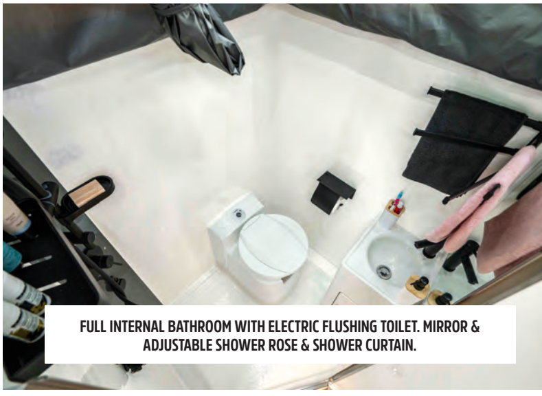
FULL INTERNAL BATHROOM WITH ELECTRIC FLUSHING TOILET. MIRROR & ADJUSTABLE SHOWER ROSE & SHOWER CURTAIN.