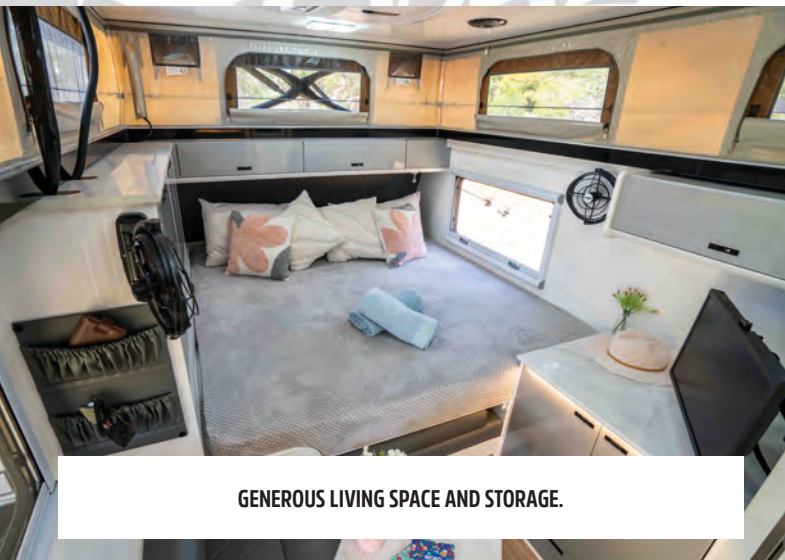
GENEROUS LIVING SPACE AND STORAGE.