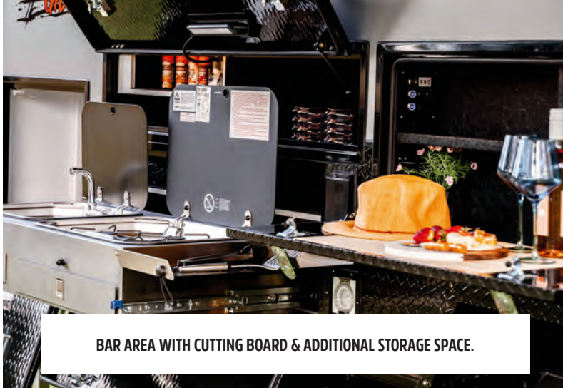
BAR AREA WITH CUTTING BOARD & ADDITIONAL STORAGE SPACE.