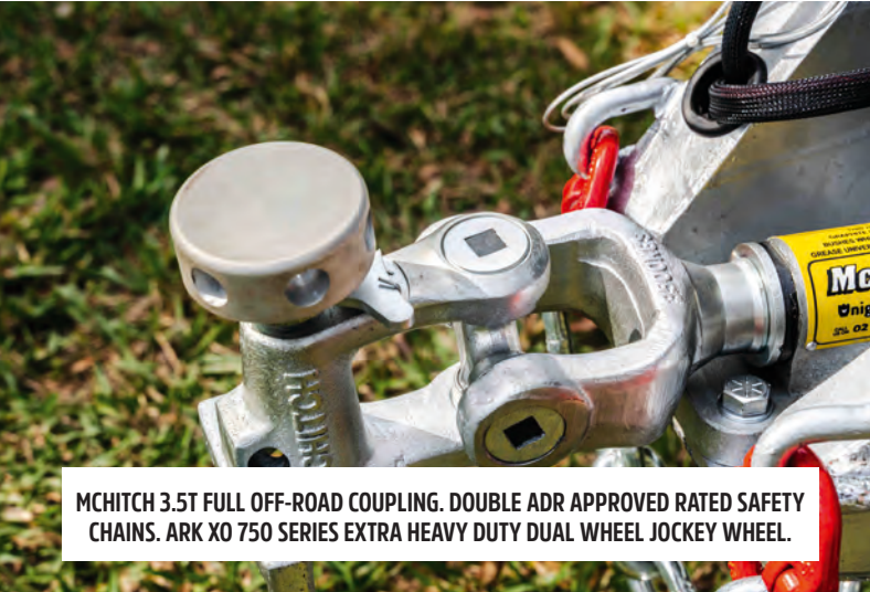
MCHITCH 3.5T FULL OFF-ROAD COUPLING. DOUBLE ADR APPROVED RATED SAFETY CHAINS. ARK XO 750 SERIES EXTRA HEAVY DUTY DUAL WHEEL JOCKEY WHEEL.