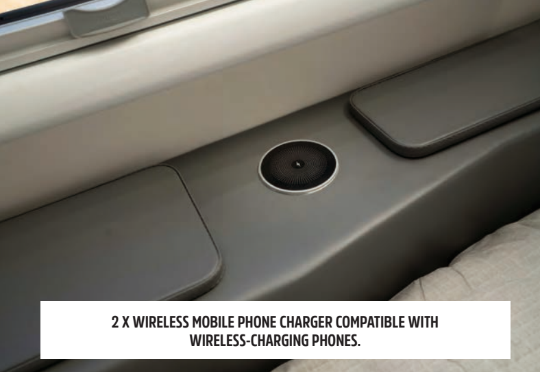
2 X WIRELESS MOBILE PHONE CHARGER COMPATIBLE WITH WIRELESS-CHARGING PHONES.