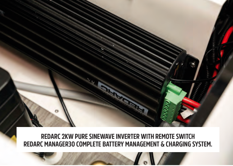
REDARC 2KW PURE SINEWAVE INVERTER WITH REMOTE SWITCH REDARC MANAGER30 COMPLETE BATTERY MANAGEMENT & CHARGING SYSTEM.