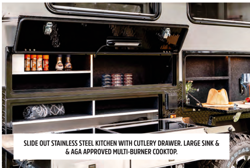
SLIDE OUT STAINLESS STEEL KITCHEN WITH CUTLERY DRAWER. LARGE SINK & AGA APPROVED MULTI-BURNER COOKTOP.