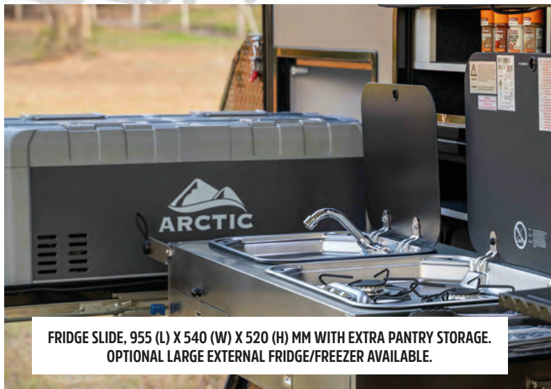
FRIDGE SLIDE, 955 (L) X 540 (W) X 520 (H) MM WITH EXTRA PANTRY STORAGE. OPTIONAL LARGE EXTERNAL FRIDGE/FREEZER AVAILABLE.