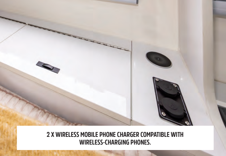
2 X WIRELESS MOBILE PHONE CHARGER COMPATIBLE WITH WIRELESS-CHARGING PHONES.