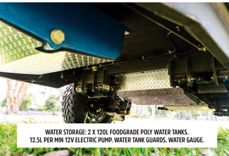
WATER STORAGE: 2 X 120L FOODGRADE POLY WATER TANKS. 12.5L PER MIN 12V ELECTRIC PUMP. WATER TANK GUARDS, WATER GAUGE.