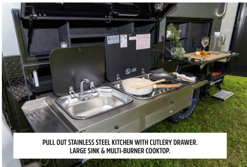
PULL OUT STAINLESS STEEL KITCHEN WITH CUTLERY DRAWER. LARGE SINK & MULTI-BURNER COOKTOP.