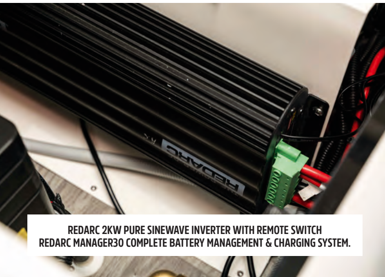
REDARC 2KW PURE SINEWAVE INVERTER WITH REMOTE SWITCH REDARC MANAGER30 COMPLETE BATTERY MANAGEMENT & CHARGING SYSTEM.