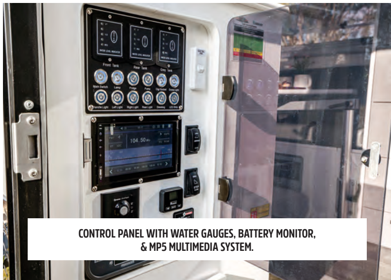
CONTROL PANEL WITH WATER GAUGES, BATTERY MONITOR, & MP5 MULTIMEDIA SYSTEM.