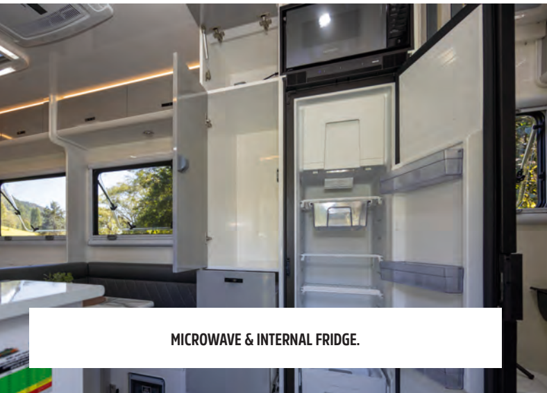
MICROWAVE & INTERNAL FRIDGE.