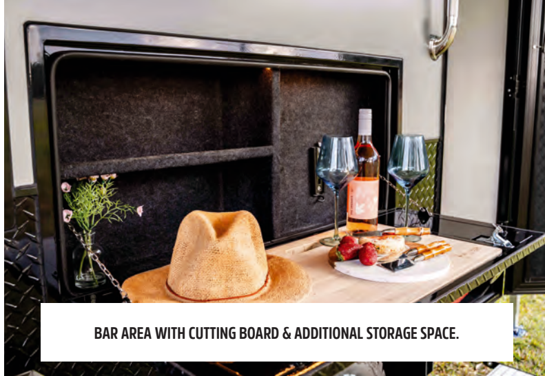
BAR AREA WITH CUTTING BOARD & ADDITIONAL STORAGE SPACE.