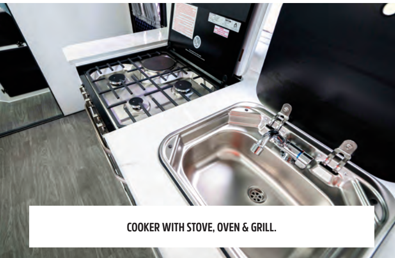
COOKER WITH STOVE, OVEN & GRILL.