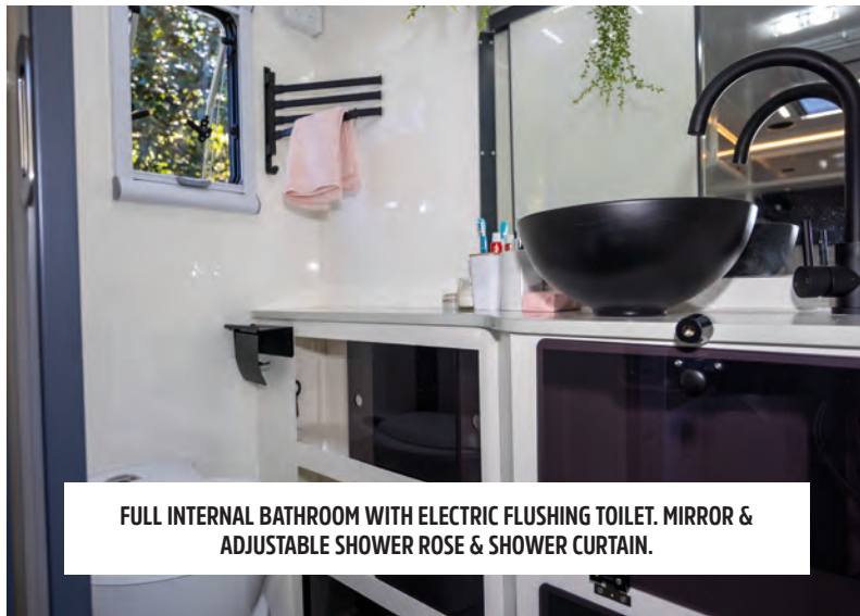
FULL INTERNAL BATHROOM WITH ELECTRIC FLUSHING TOILET. MIRROR & ADJUSTABLE SHOWER ROSE & SHOWER CURTAIN.