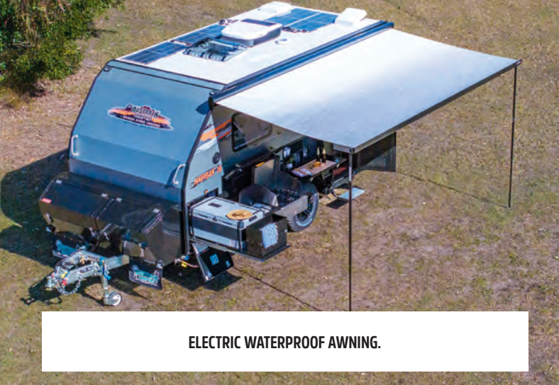
ELECTRIC WATERPROOF AWNING.