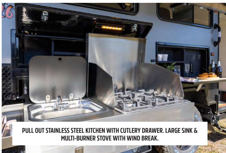
PULL OUT STAINLESS STEEL KITCHEN WITH CUTLERY DRAWER. LARGE SINK & MULTI-BURNER STOVE WITH WIND BREAK.