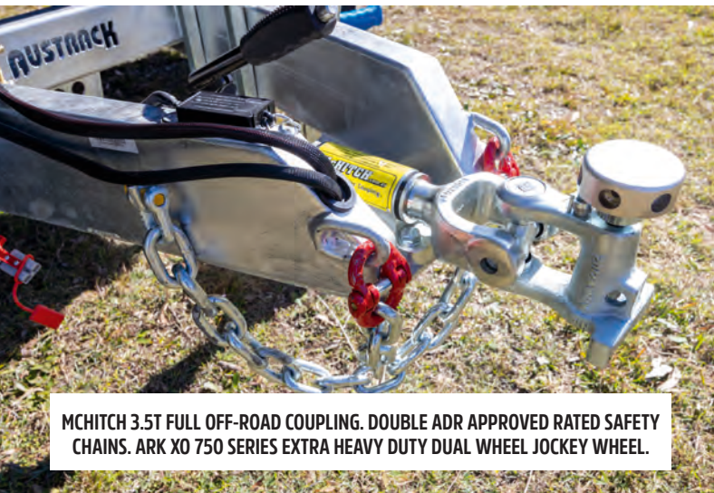
MCHITCH 3.5T FULL OFF-ROAD COUPLING. DOUBLE ADR APPROVED RATED SAFETY CHAINS. ARK XO 750 SERIES EXTRA HEAVY DUTY DUAL WHEEL JOCKEY WHEEL.