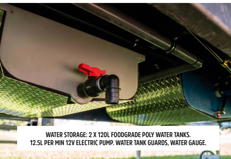
WATER STORAGE: 2 X 120L FOODGRADE POLY WATER TANKS. 12.5L PER MIN 12V ELECTRIC PUMP. WATER TANK GUARDS, WATER GAUGE.