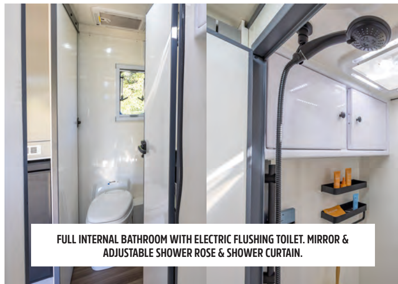
FULL INTERNAL BATHROOM WITH ELECTRIC FLUSHING TOILET. MIRROR & ADJUSTABLE SHOWER ROSE & SHOWER CURTAIN.