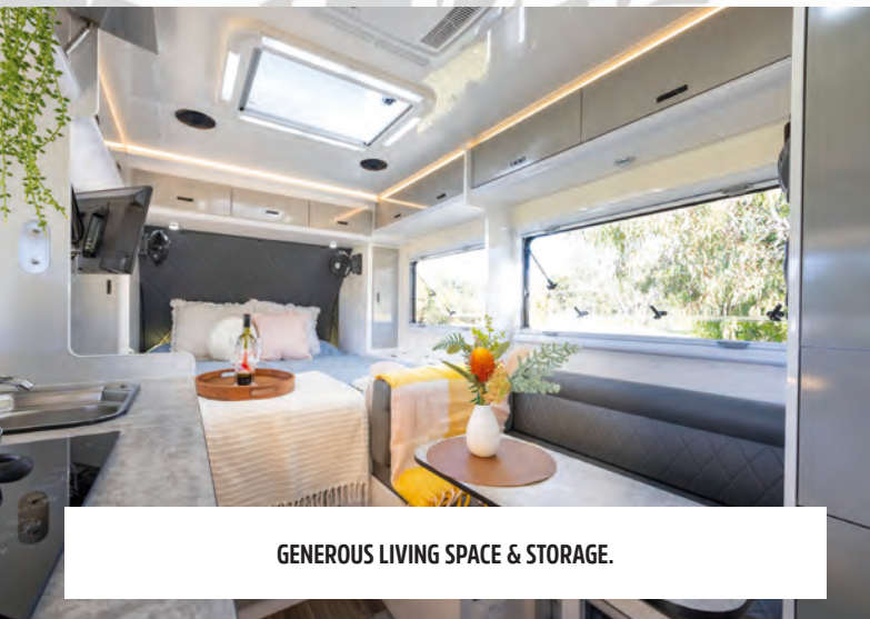
GENEROUS LIVING SPACE & STORAGE.