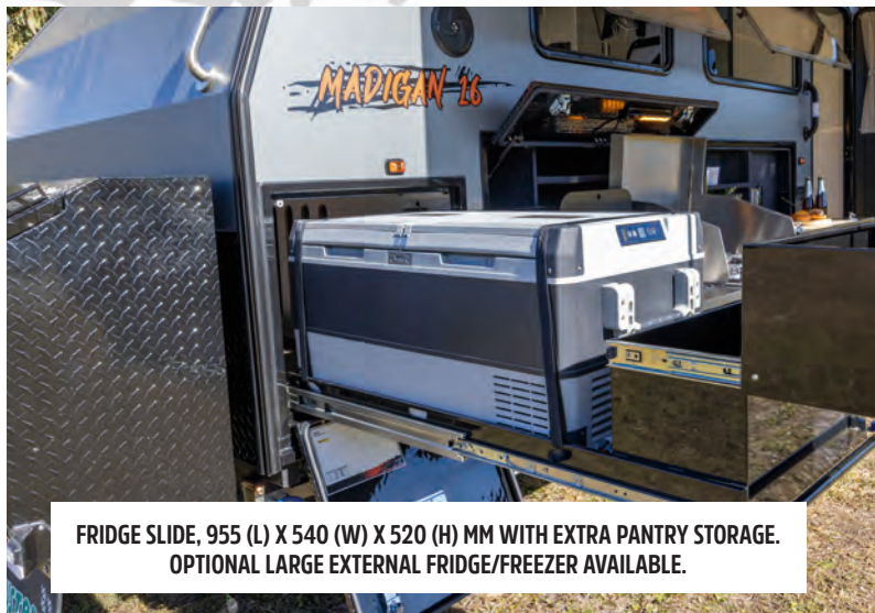
FRIDGE SLIDE, 955 (L) X 540 (W) X 520 (H) MM WITH EXTRA PANTRY STORAGE. OPTIONAL LARGE EXTERNAL FRIDGE/FREEZER AVAILABLE.