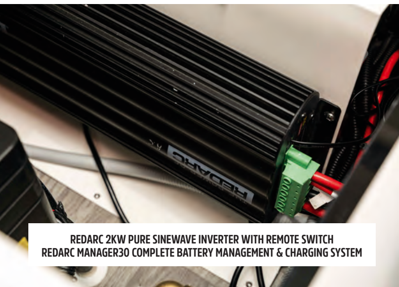
REDARC 2KW PURE SINEWAVE INVERTER WITH REMOTE SWITCH REDARC MANAGER30 COMPLETE BATTERY MANAGEMENT & CHARGING SYSTEM