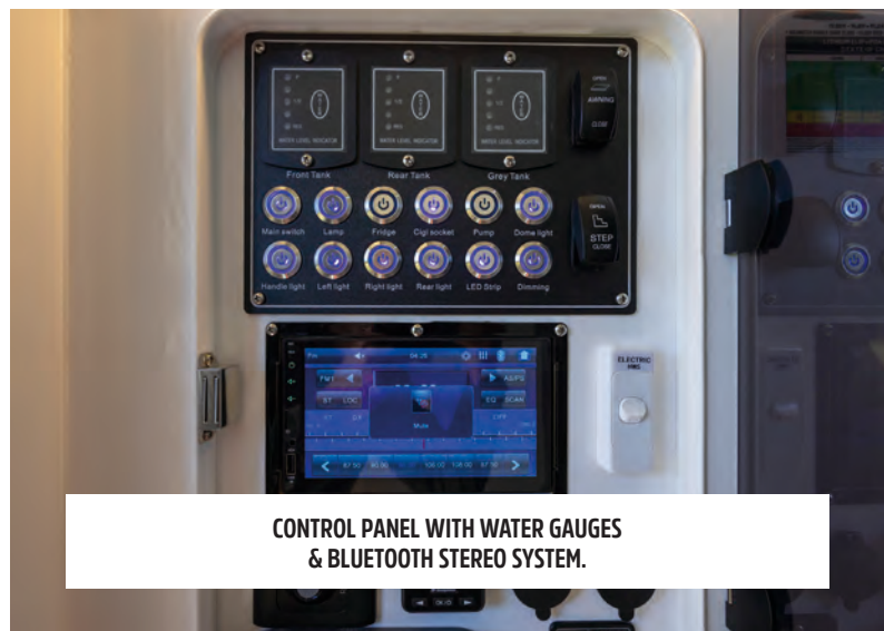
CONTROL PANEL WITH WATER GAUGES & BLUETOOTH STEREO SYSTEM.