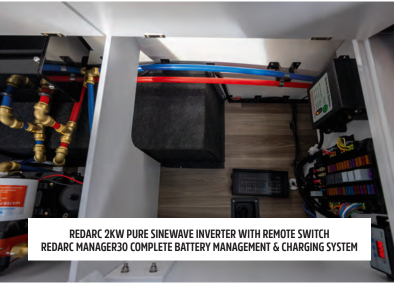
REDARC 2KW PURE SINWAVE INVERTER WITH REMOTE SWITCH REDARC MANAGER30 COMPLETE BATTERY MANAGEMENT & CHARGING SYSTEM