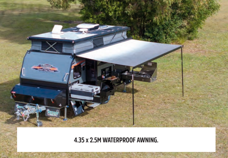
4.35 x 2.5M WATERPROOF AWNING.