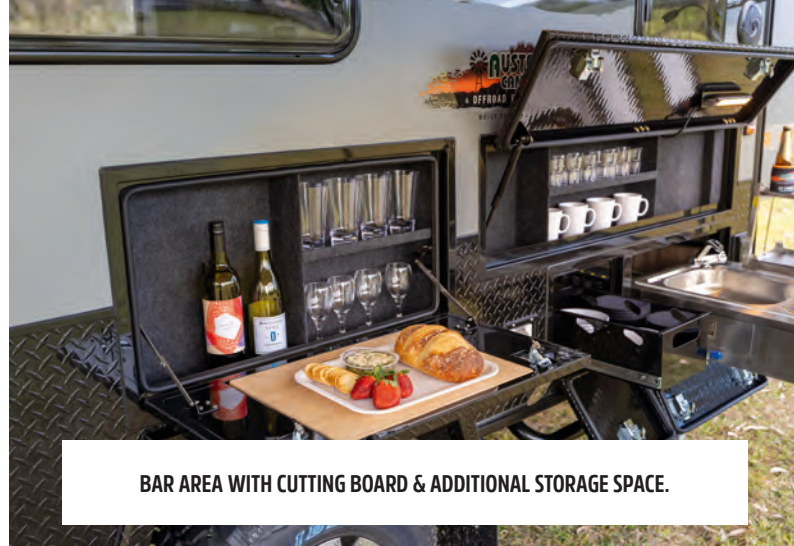
BAR AREA WITH CUTTING BOARD & ADDITIONAL STORAGE SPACE.