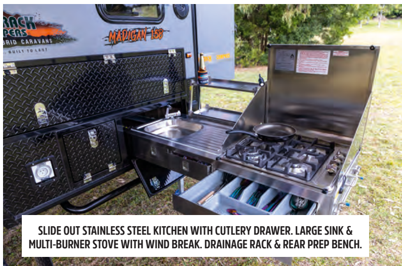
SLIDE OUT STAINLESS STEEL KITCHEN WITH CUTLERY DRAWER. LARGE SINK & MULTI-BURNER STOVE WITH WIND BREAK. DRAINAGE RACK & REAR PREP BENCH.