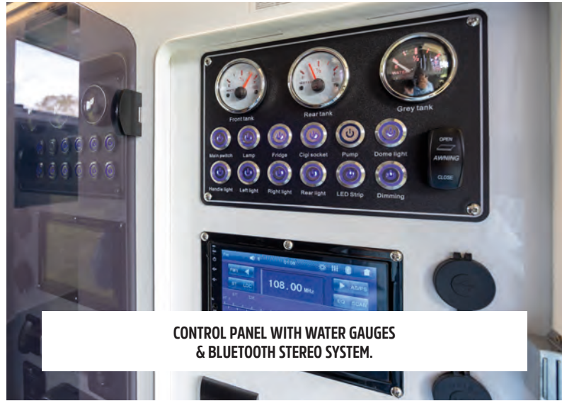
CONTROL PANEL WITH WATER GAUGES & BLUETOOTH STEREO SYSTEM.