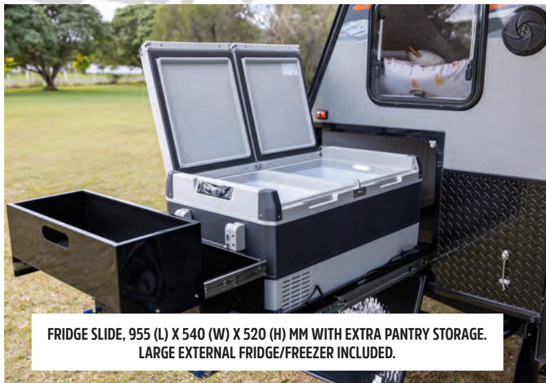
FRIDGE SLIDE, 955 (L) X 540 (W) X 520 (H) MM WITH EXTRA PANTRY STORAGE. LARGE EXTERNAL FRIDGE/FREEZER INCLUDED.