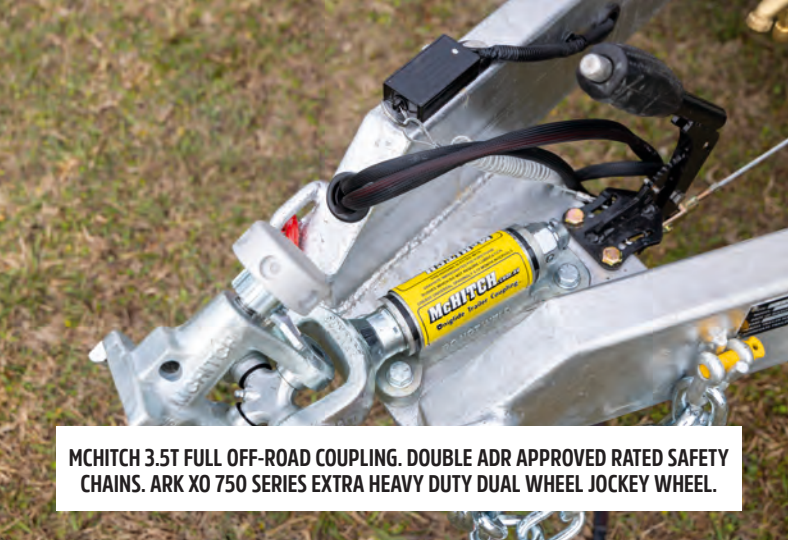
MCHITCH 3.5T FULL OFF-ROAD COUPLING. DOUBLE ADR APPROVED RATED SAFETY CHAINS. ARK XO 750 SERIES EXTRA HEAVY DUTY DUAL WHEEL JOCKEY WHEEL.