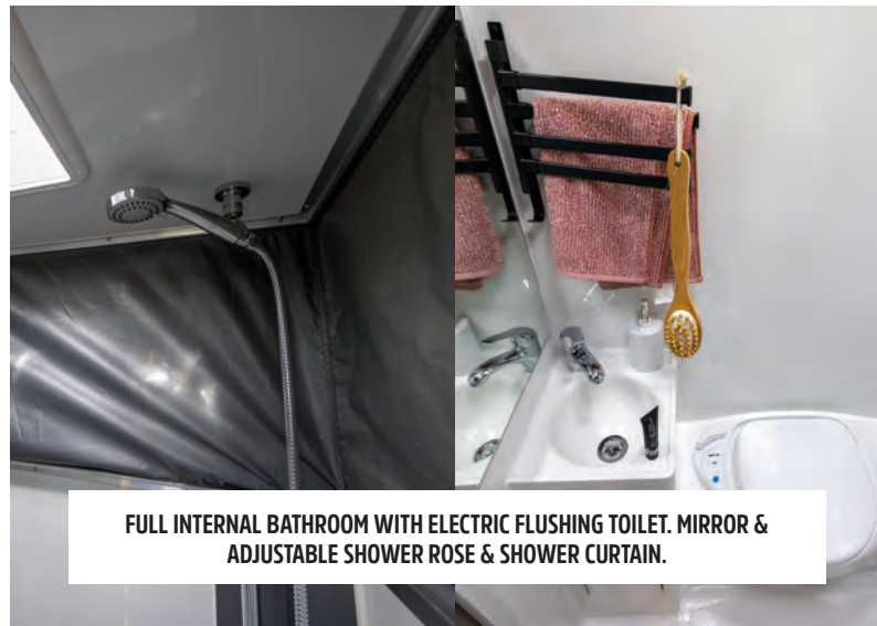
FULL INTERNAL BATHROOM WITH ELECTRIC FLUSHING TOILET. MIRROR & ADJUSTABLE SHOWER ROSE & SHOWER CURTAIN.