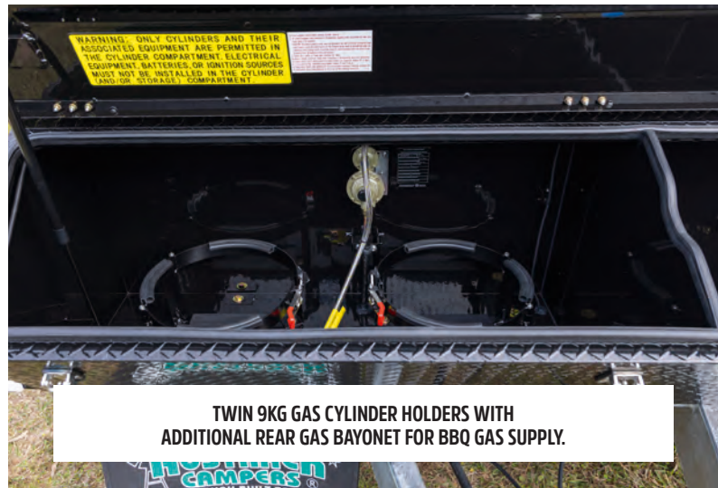
TWIN 9KG GAS CYLINDER HOLDERS WITH ADDITIONAL REAR GAS BAYONET FOR BBQ GAS SUPPLY.