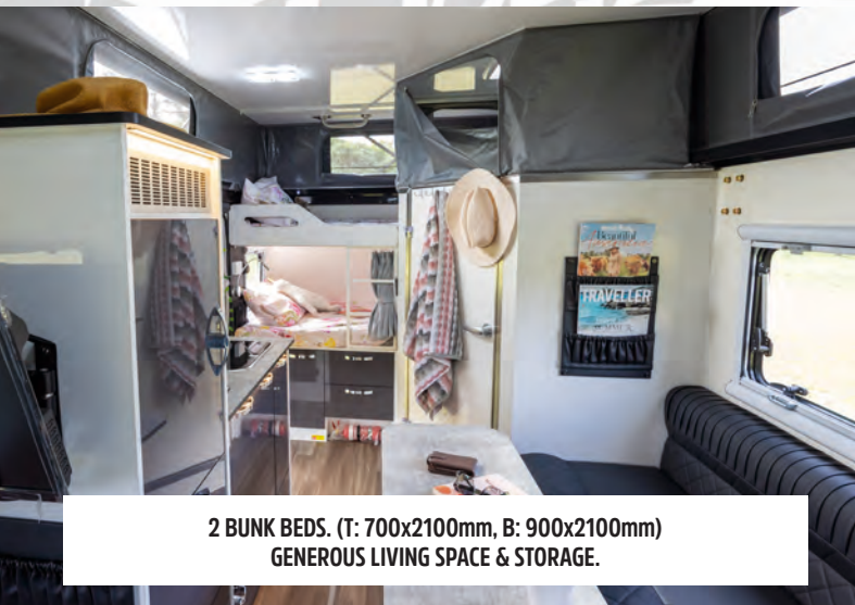
2 BUNK BEDS. (T: 700x2100mm, B: 900x2100mm) GENEROUS LIVING SPACE & STORAGE.